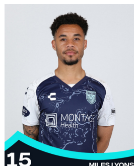
15 MILES LYONS